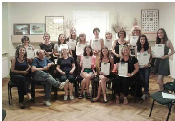
Handing out certificates

On Saturday evening we received our certificates and we reflected on the course, sharing our opinions and feelings about the camp. Sunday was departure day, so we all had to go our separate ways. We were a small group and the So(u)l Camp was being organised for the first time in Serbia; hopefully it won't be the last! Personally I'd recommend any English teacher to go to a So(u)l Camp and experience it for themselves.