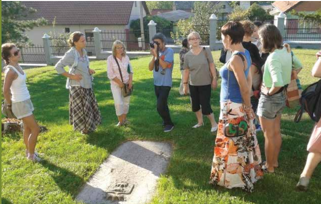
The Chapel of Peace

When I learned that experts from Slovenia had repaired the chapel organ, it made me really proud. We found out about the significance of this chapel in history and we talked about how we could use a local historical place like this in our own fieldwork. Local historical events can make a great lesson, as we experience first-hand at the Chapel of Peace.