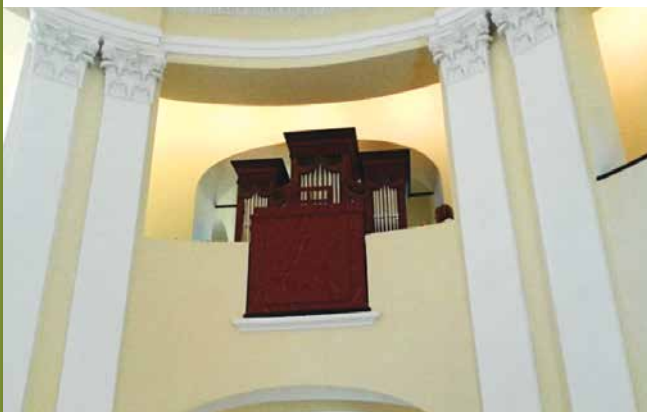
Organ in the Chapel of Peace

When I learned that experts from Slovenia had repaired the chapel organ, it made me really proud. We found out about the significance of this chapel in history and we talked about how we could use a local historical place like this in our own fieldwork. Local historical events can make a great lesson, as we experience first-hand at the Chapel of Peace.