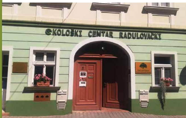
Our hostel

Even before the camp, we received homework! We got to do some interesting tasks at home, e.g. we had to bring something from our country, to look through our desks and to think about different things that we are interested in (favourite book, poem, bucket list). I was to be the only participant from Slovenia. I took the train to Belgrade and then a bus to Sremski Karlovci. Although it took 11 hours to get there, I enjoyed the journey. I got to see plenty of places and people, got to know the country a bit and didn't have to worry about traffic jams. There were around 15 participants, mostly from Eastern Europe. We stayed in the beautiful town of Sremski Karlovci in the Eco Centar Radulovački hostel.