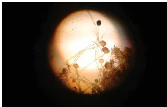
Brick mould under the microscope

We also had some great fieldwork tasks, one of which was CLIL-related (Content and Language Integrated Learning). We learned about the restoration of old buildings and archaeology and met some scientists, who gave us a lot of useful information about their work. For example, we got to look at mould under the microscope and learnt about the procedure of how to remove it from old brickwork.