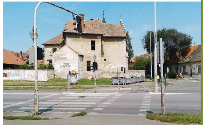
The Museum of Destruction in Zrenjanin

We also got to experience work with recent history and memories that are still deep and painful for local people. A local teacher guided us through the town Zrenjanin and the Museum of Destruction. We also got new ideas on how to use recent history in our classes and how we can use minimum input/maximum output in different situations.