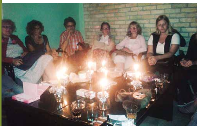
International evening

Every day we had a different motto, one of which was only connect. We connected both with each other and with the environment. There were a lot of comments to the effect that we usually do not get to really connect with the place we’re staying in as well as we did here, and we all were grateful for that feeling of connection. We also had an “international evening” sharing presents, which was turned into a guessing game; this was great fun and we really got to know each other better.