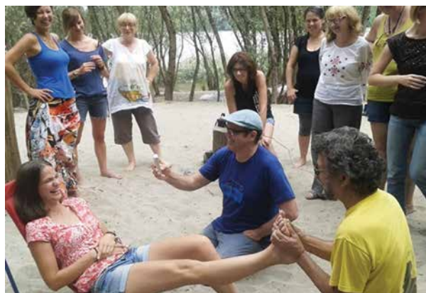
One of the tasks ☺

ing process. One evening, for example, we watched a movie and then discussed it as a possible class item.